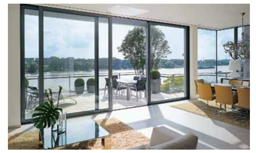
Select an arrangement up to six leaves (single, double or triple tracks)