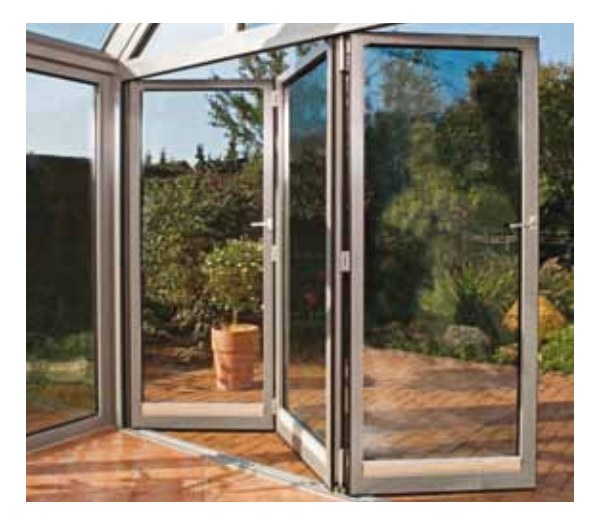
You can have a flush threshold