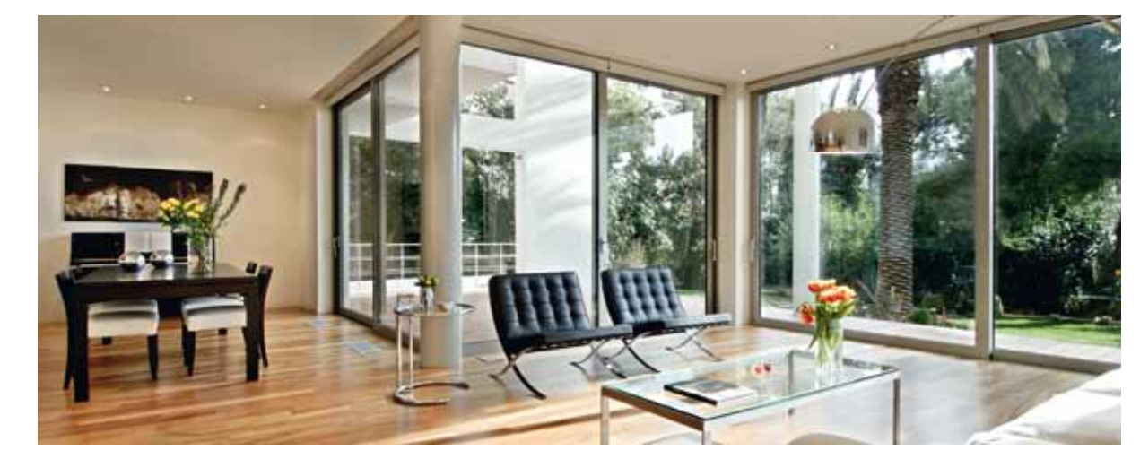
Narrow sight lines allow maximum light to flood into a room

Imagine sliding open a door on a warm sunny morning and finding summer filling your house. Or perhaps you're having a party and want to allow a roomful of guests to spill out into the garden in the cool of the evening?