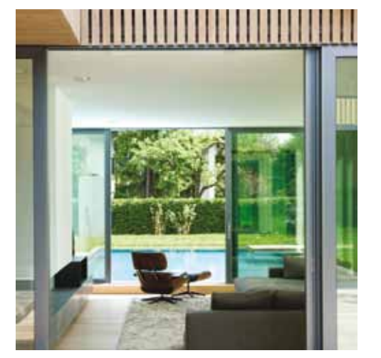
Perfect for internal and external use

A Schueco sliding door is a window onto the world. It opens and closes effortlessly, disclosing great views onto the garden or patio. It allows you to enjoy all the fresh air you want while simultaneously ensuring that you're warm and comfortable when the weather turns cold.