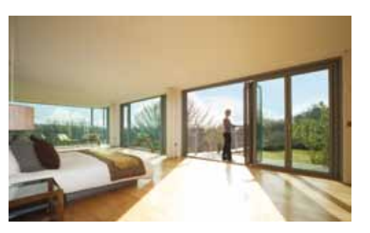
... glides back on precision rollers ...