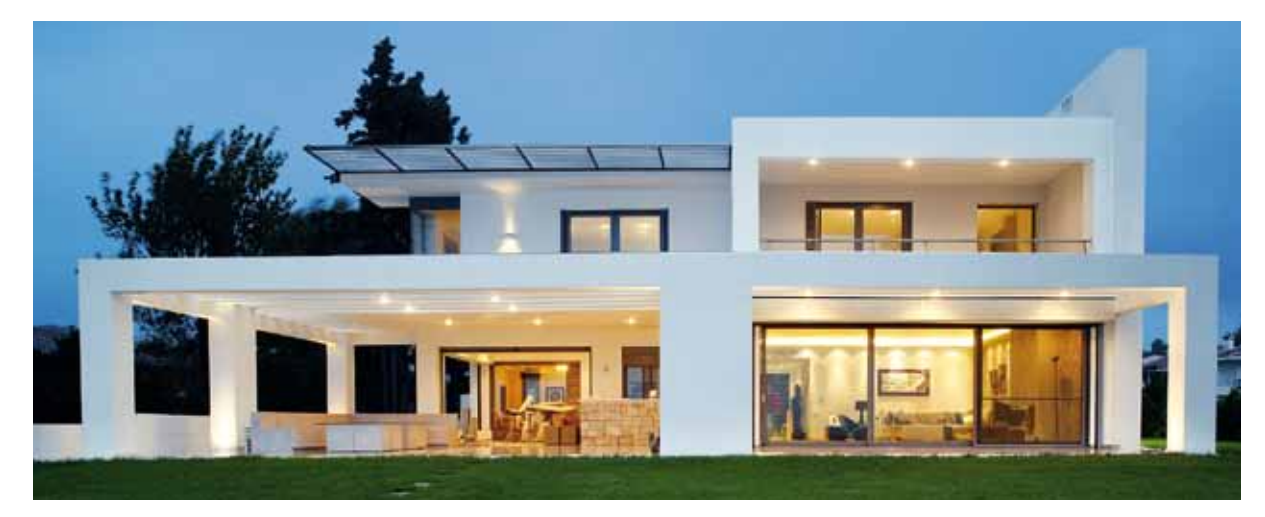
You can choose from doors that slide, lift-and-slide, tilt-and-slide or fold