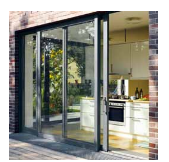
A lift-and-slide door with low threshold