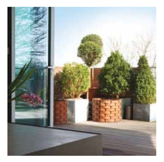
Choice of handles and stainless steel multi-point locks