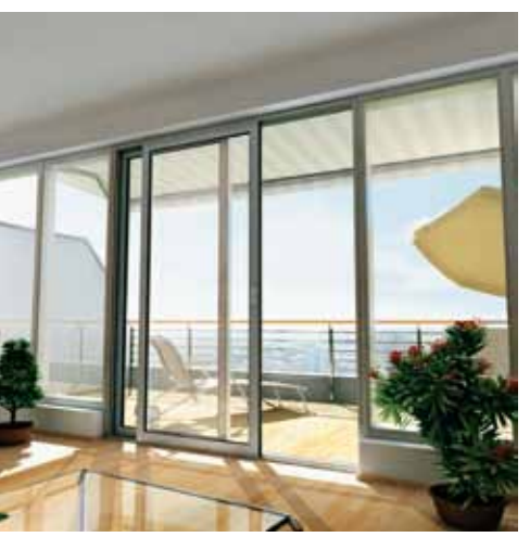
Draught-free and watertight