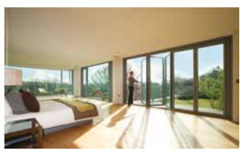
The door opens effortlessly ...