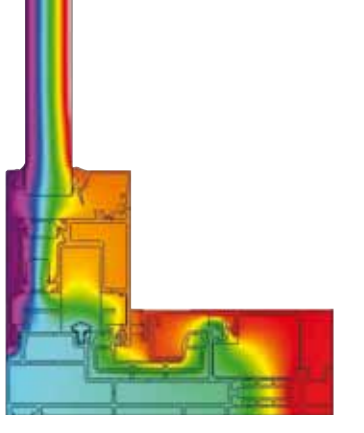
Every door is designed to provide optimum thermal insulation