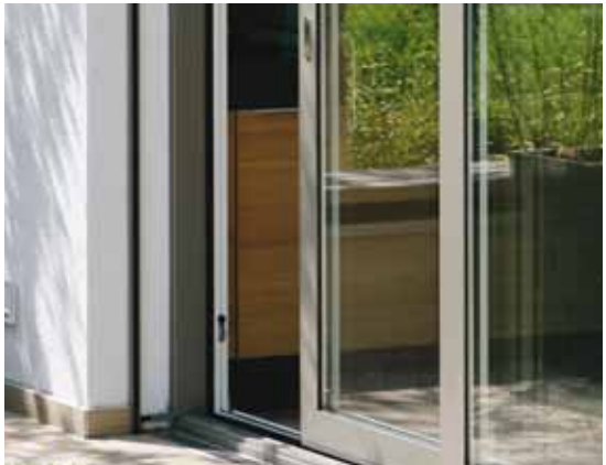
Multi-point locking for maximum security

Finally, we've addressed security concerns by fitting multi-point locking to ensure a level of burglar resistance up to EN V 1627 Class 2. So now you can enjoy the view and total peace of mind.