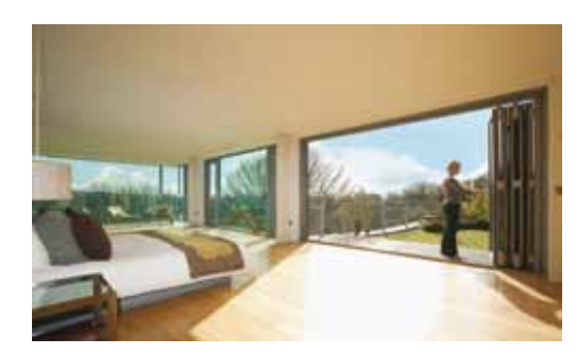
... and neatly stacks to provide maximum space