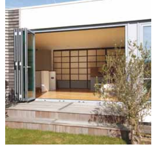
Individual leaves up to 3 m high and 1.2 m wide