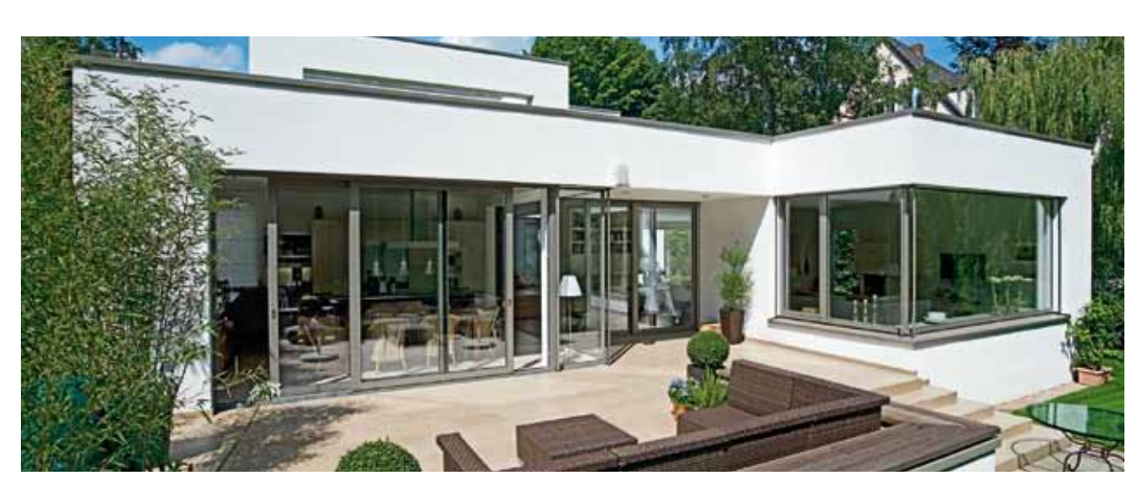
Different levels of security can be achieved up to EN V 1627 Class 2

has been designed to look good and perform superbly year after year, a quiet statement of style and quality that can't help but impress.